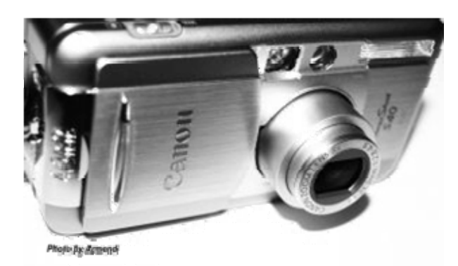
Defining and Fine Tuning Image Noise

Compression used in either horizontal or vertical direction can result in the loss of a small amount of RAW image data ultimately it is the photographer that must chose where they want to compromise whether on quality, storage demands and/or time constraints.